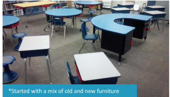
School: Ryerson Elementary Project: New Accentuated Learning Environment