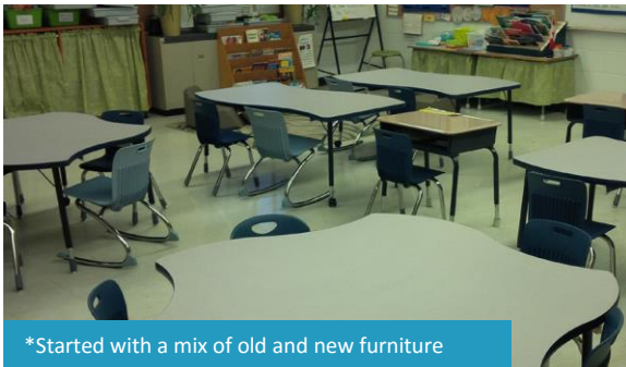
School: Gilbert Plains Project: Accentuated Learning Environment