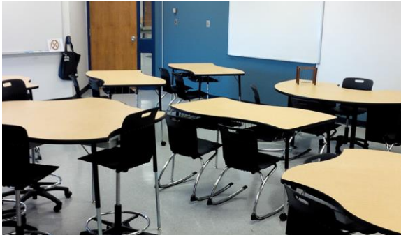
School: River West Park School Project: New Accentuated Learning Environment