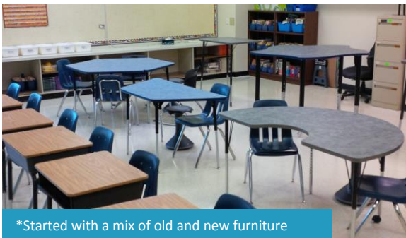
School: École George-McDowell Project: Accentuated Learning Environment