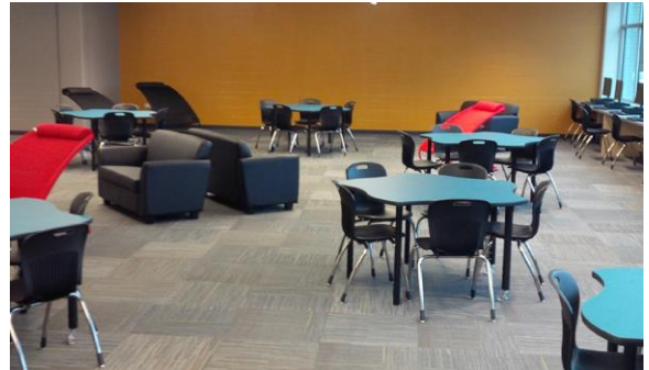
School: Steinbach Regional Secondary School Project: New Learning Commons