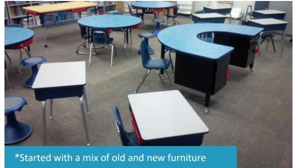
School: Ryerson Elementary Project: New Accentuated Learning Environment