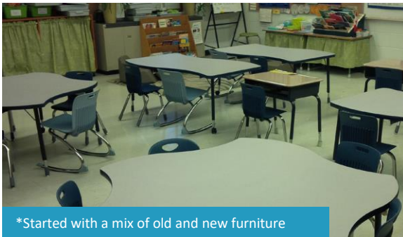
School: Gilbert Plains Project: Accentuated Learning Environment