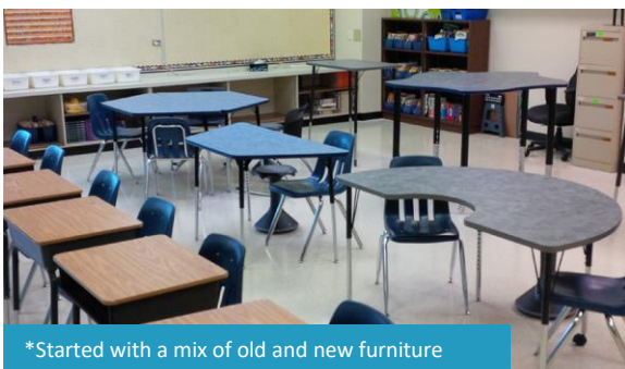
School: École George-McDowell Project: Accentuated Learning Environment