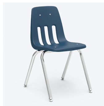
Classic Series Stacking Chair

This iconic, original stacking chair is time tested, highly durable and stacks 8 high. Available in a range of colors and sizes.