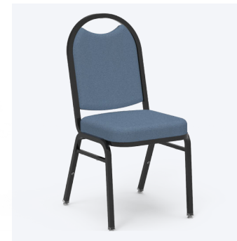
8900 Series Stacking Chair

This iconic, original stacking chair is time tested, highly durable and stacks 8 high. Available in a range of colors and sizes.