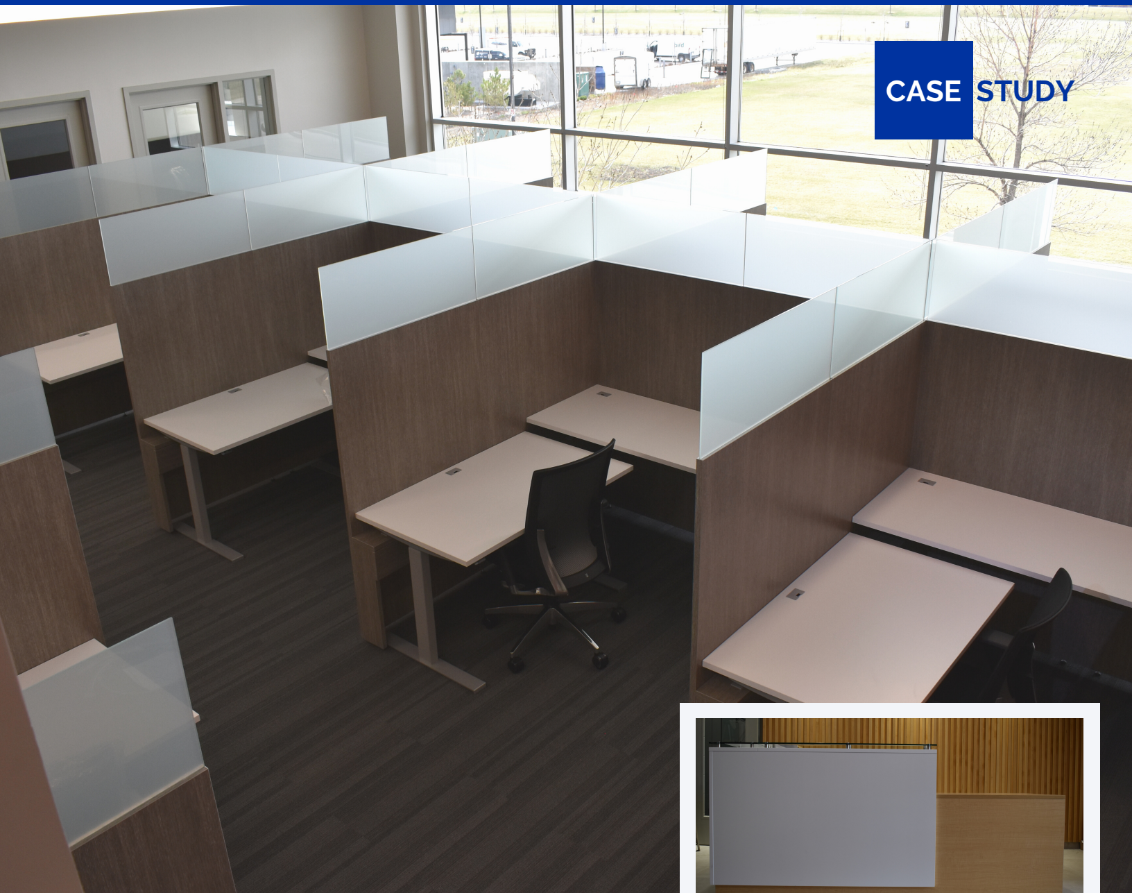
Typical Workstations —