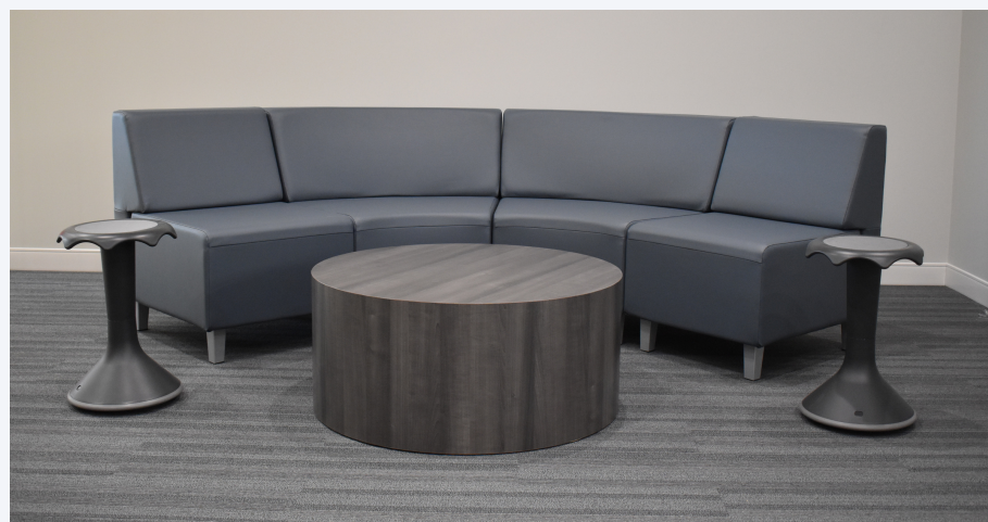
— Brainstorming Room