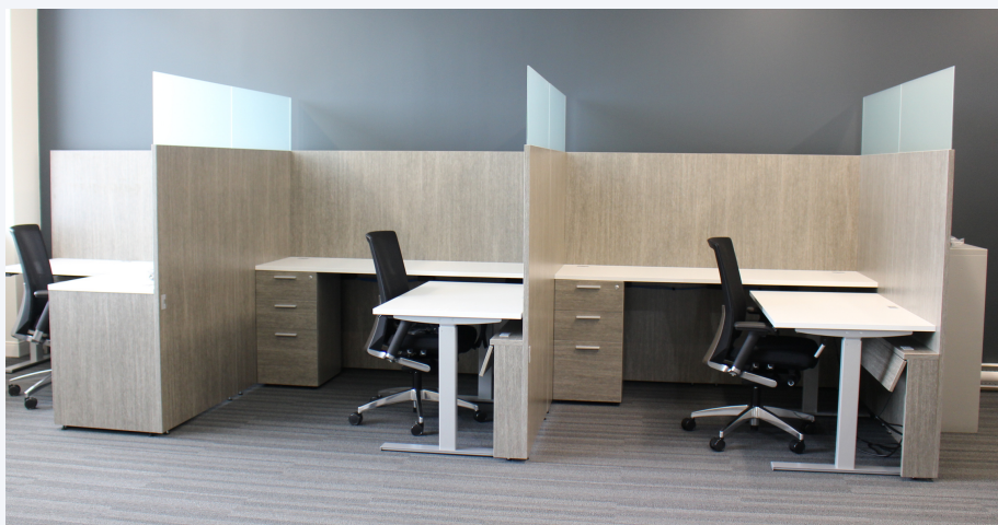
— Typical Workstation