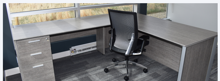
— Private Office