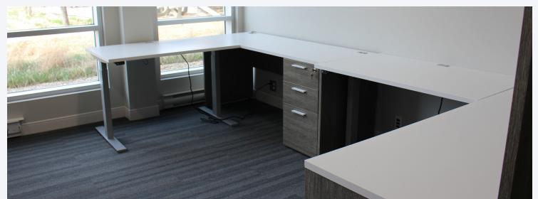
— Double Workstation